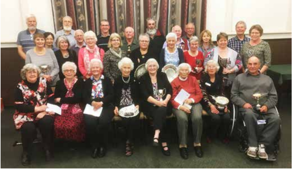
AGM & Prizewinners 2018