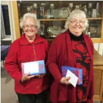
East Otago Winners