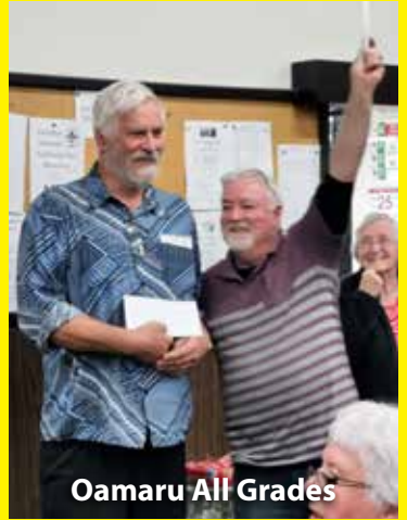
Oamaru All Grades