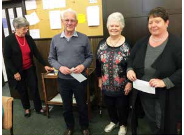
Cancer Charity Tournament