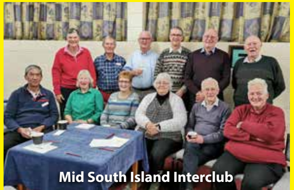
Mid South Island Interclub