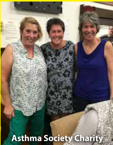
Asthma Society Charity