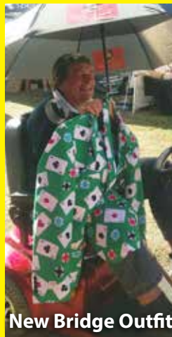
New Bridge Outfit