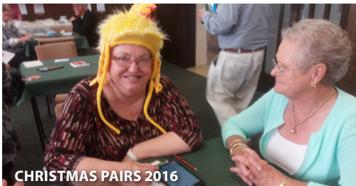
CHRISTMAS PAIRS 2016