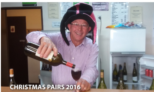
CHRISTMAS PAIRS 2016