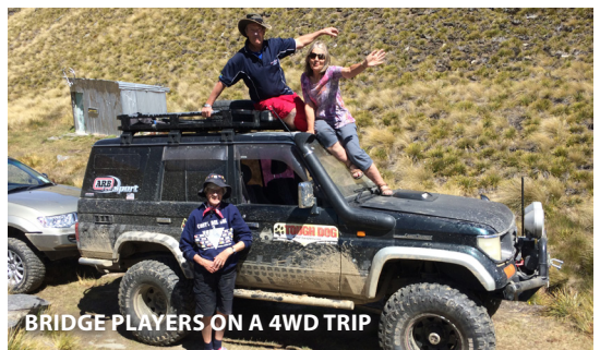
BRIDGE PLAYERS ON A 4WD TRIP