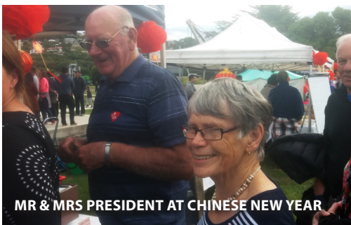
MR & MRS PRESIDENT AT CHINESE NEW YEAR