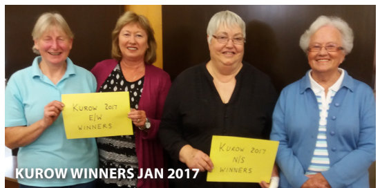
KUROW WINNERS JAN 2017