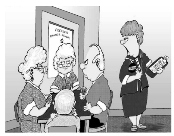
<sup>4</sup> No, Mrs, Finster, when you're counting your losers, you do NOT include your partner ! "

As opponents you should try not to ask questions if you don't intend to bid. Don't delay when declarer is thinking about making a finesse. These are all things to be aware of!!