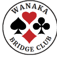
Table Talk Feb 2024